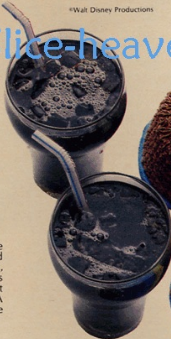
It's Mickey Mouse!